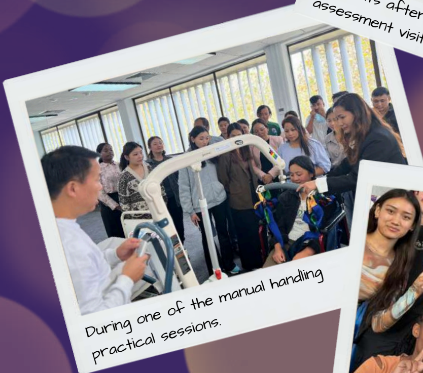
During one of the manual handling practical sessions.