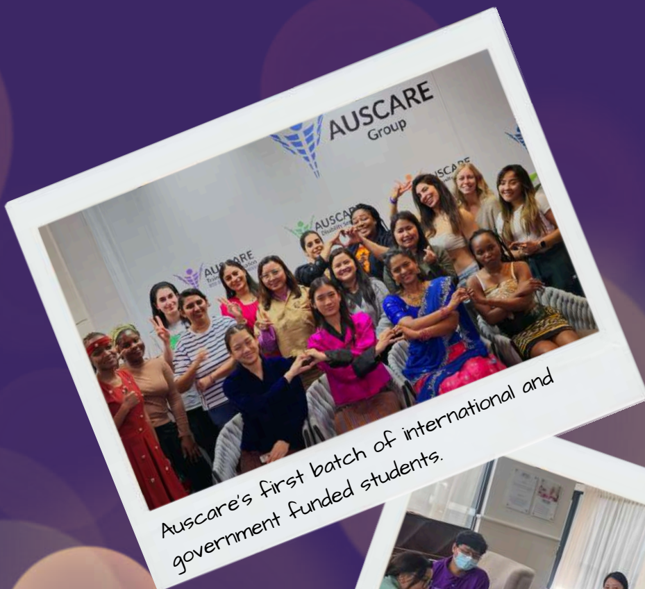
Auscare's first batch of international and government funded students.