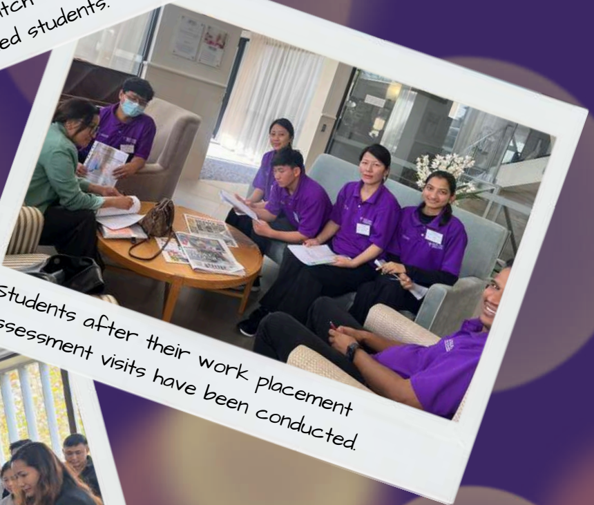
Students after their work placement assessment visits have been conducted.